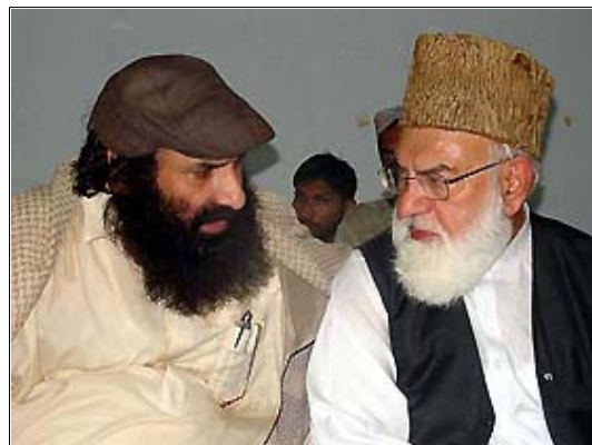
Syed Salahuddin (left), supreme commander of militant group Hizbul Mujahideen, talks to Qazi Hussain Ahmed, chief of Pakistani religious party Jamat-i-Islami, at Martyr's Convention on the occasion of Pakistan's 57th Independence Day in Lahore on Saturday.