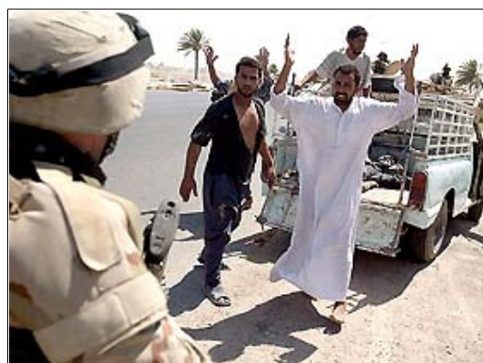
A US soldier stops a pick-up truck driven by family members trying to take a critically wounded man to hospital from a neighbourhood outside the Baghdad suburb of al Sadr City, on Saturday. The