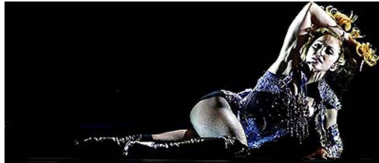
US pop diva Madonna begins the UK leg of her re-invention world tour at the MEN Arena, Manchester, on Saturday.

David Lean's Oscar-winning epic, Lawrence of Arabia , has emerged as the best British film of all time and Sir Anthony Hopkins the favourite British actor, according to a poll. The 1962-film, which starred Peter O'Toole as the enigmatic T.E Lawrence, was one of four Lean classics to make it to the top 10 in the poll conducted by The Sunday Telegraph.